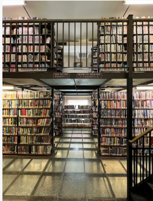
Photo of the stacks and glass floor